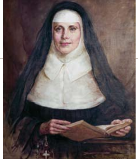
Sister Catherine McAuley